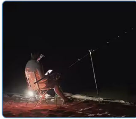
Fishing at night