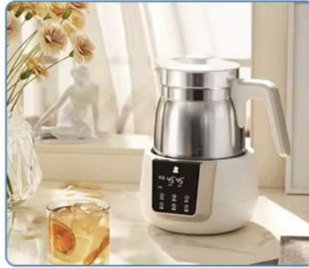
Household Electric Appliances