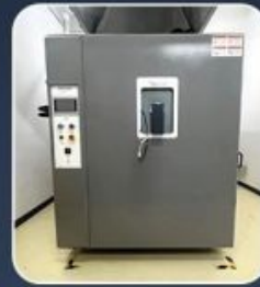
High and low temperature cycle box