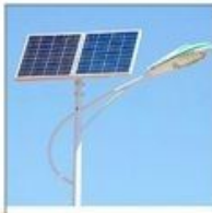
Solar street light