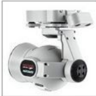
Military and Police Equipment