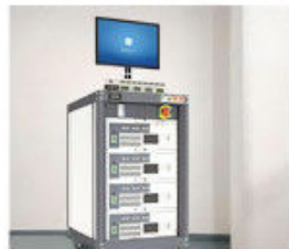
Pack Testing Equipment