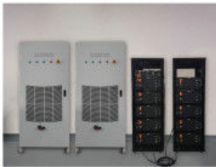
High Voltage and High Current Aging