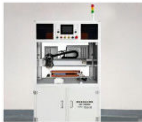
Automatic Spot Welding Equipment