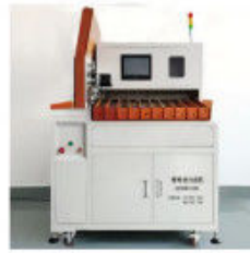
Cell Sorting Equipment