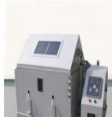
Salty Spray Box