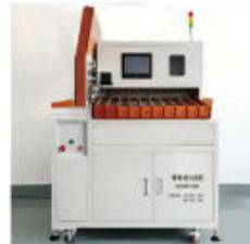
Cell Sorting Equipment