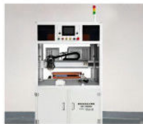
Automatic Spot Welding Equipment