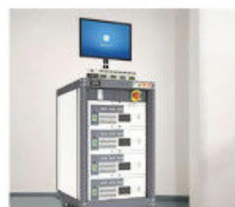
Pack Testing Equipment