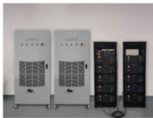
High Voltage and High Current Aging